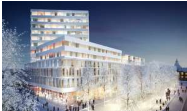
Illustration: White arkitekter