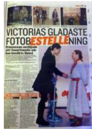
Swedish Crownprincess Victoria and Prince Daniel in 100 MIGRATORY.